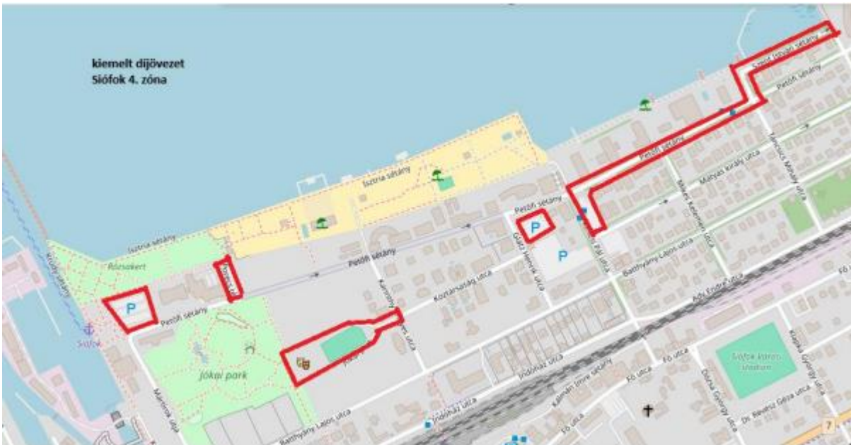
Premium Zone - Siófok Zone 4

Harbour, Porecs Square, Jókai Park, Glatz Henrik Street car park, Kinizsi Street car park, Petőfi Promenade, Szent István Promenade